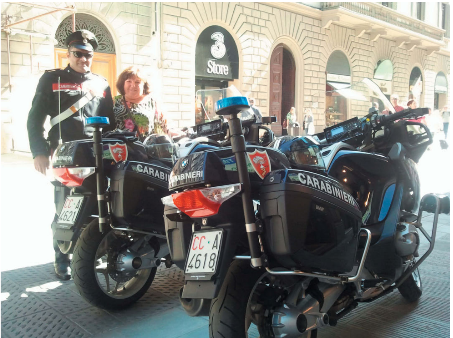
Posing with the motorcycle police in Siena

Crossing over the mountains from the east to the west side of Sardinia to Alghero, again excellent riding with lots of twisties. We pass