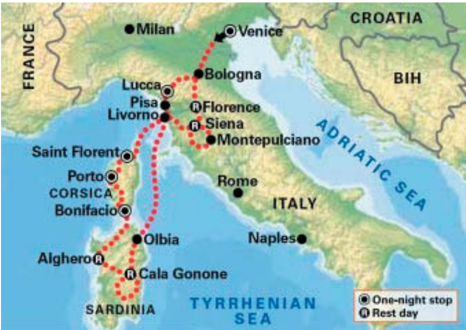
Route map for the "Tuscany Sardinia Corsica Tour"