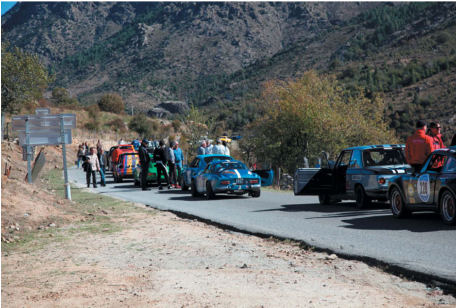
Waiting for the rally cars to be on their way

coast through the awe inspiring spiky red granite rocks jutting out of the sea, the colour changing from deep orange to russet red. We encountered the beginnings of the road rally cars in Porto. Between them and us, we have taken every available room in this small town. Our hotel did have a pool but we arrived too late in the day to appreciate it. This I think was our last chance to swim in the ocean but none of that on this leg of the trip.