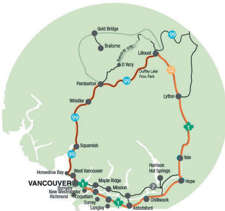
Coast Mountain Circle Route map

Check out the full site at 604pulse.com/things-to-do/?cat=1015