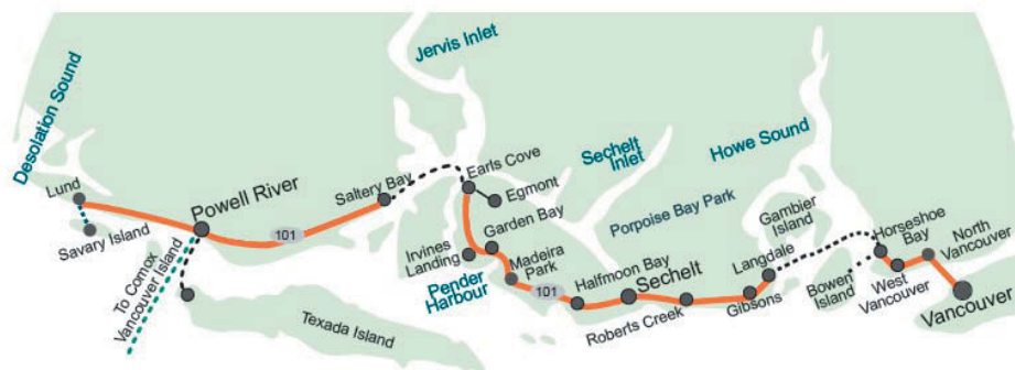
Sunshine Coast Route map

As you head east from Vancouver to Hope on Highway 1, you’ll see skyscrapers on your way to the Port Mann Bridge, a tolled engineering marvel with views of the Fraser River on either side. City scenery quickly turns into lush, green farmland, rolling hills and views of Mt. Baker as you continue eastbound through Langley and Abbotsford. As you ride through Chilliwack and Hope you’ll see why this area is a fishing paradise, with