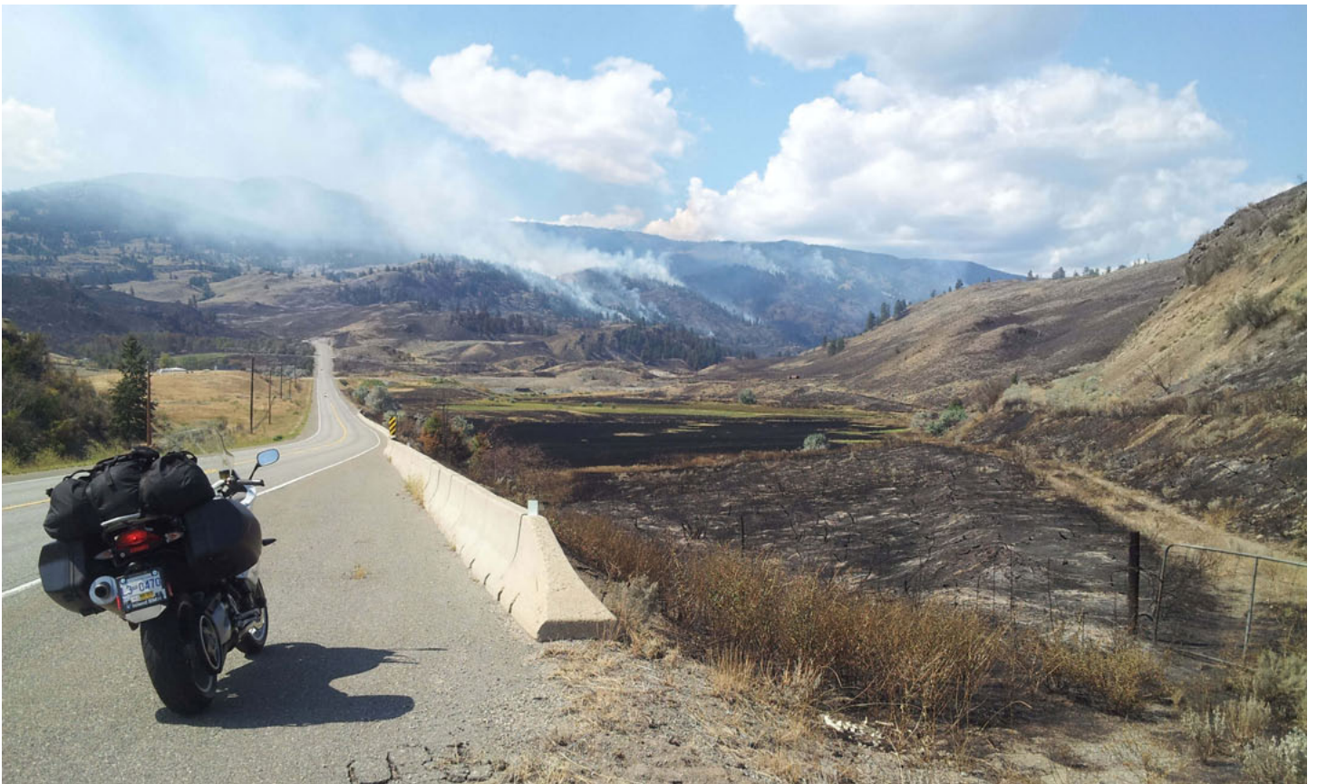
Fires are everywhere this summer.

The friendly chap consulted his computer and said "all ok". A quick top-up at the nearby Husky (no Chevron in Osoyoos) and I headed out. Roads empty, so blasted up the