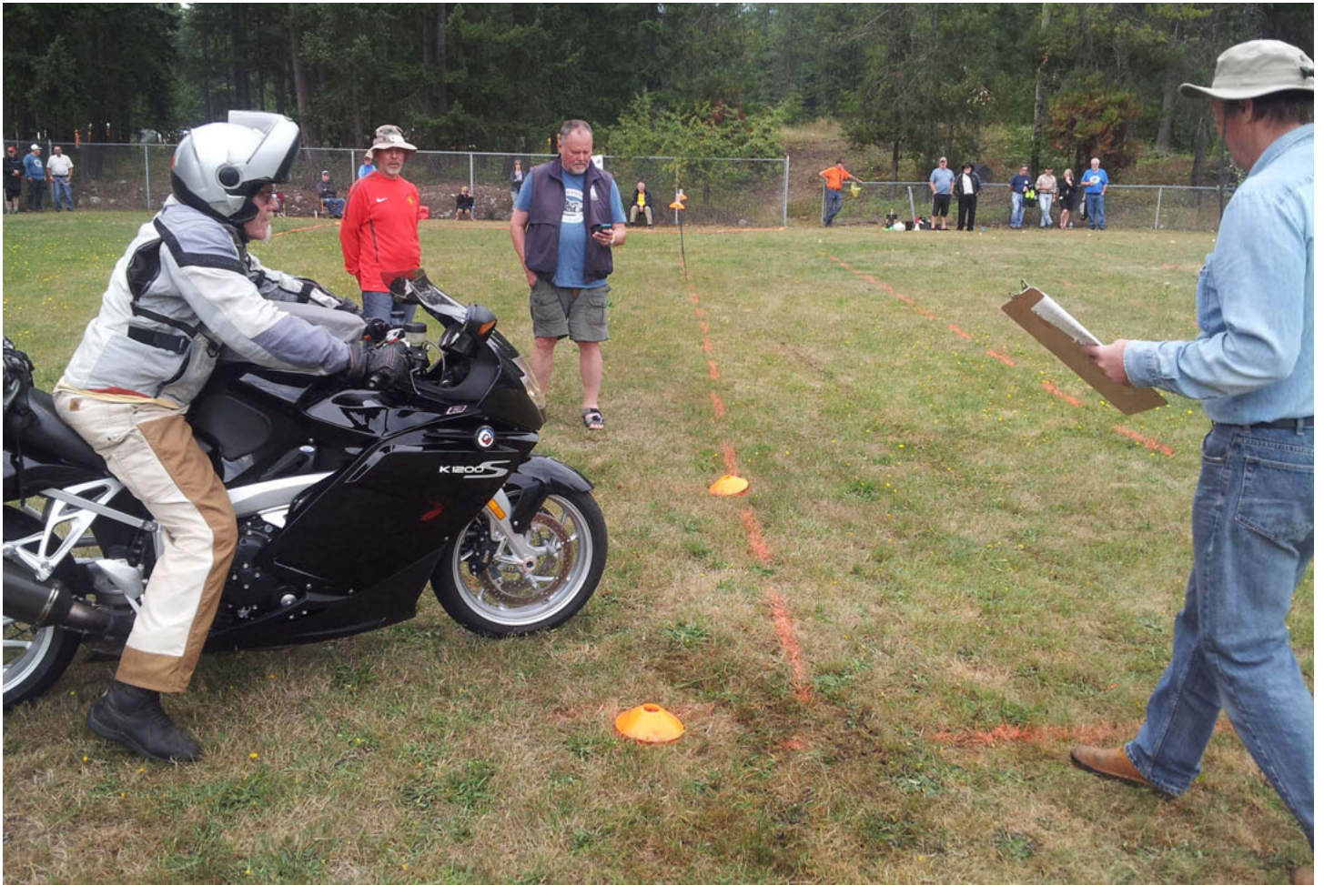
The keen organizational skills of club members were in evidence as the games commenced.