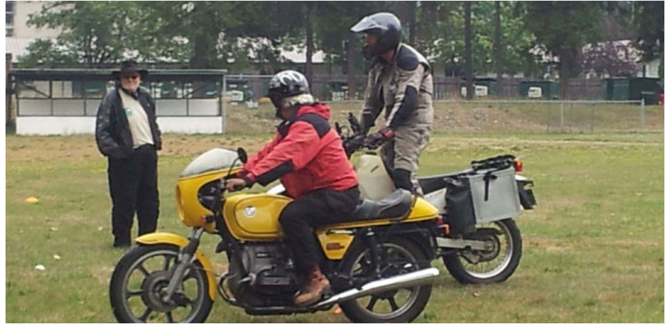
It's good to be called slow in this event.

Sunday morning dawned cool and dry. So we packed up our wet gear and headed out. Notwithstanding the warm weather I had packed