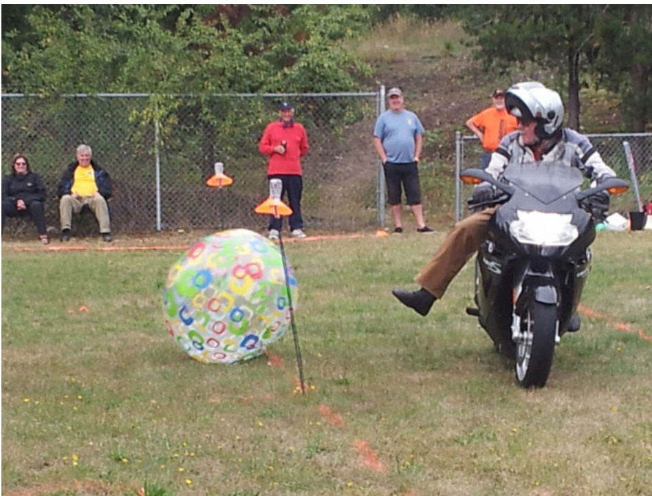
Soccer skills were needed to maneuver the ball through the goal posts.

Once again Nakusp was a good rally, great to see a lot of old friends and have a lot of fun with the games. Nakusp did not disappoint with the usual huge span of temperatures thrown at us. Will we do it again next year? – You betcha!