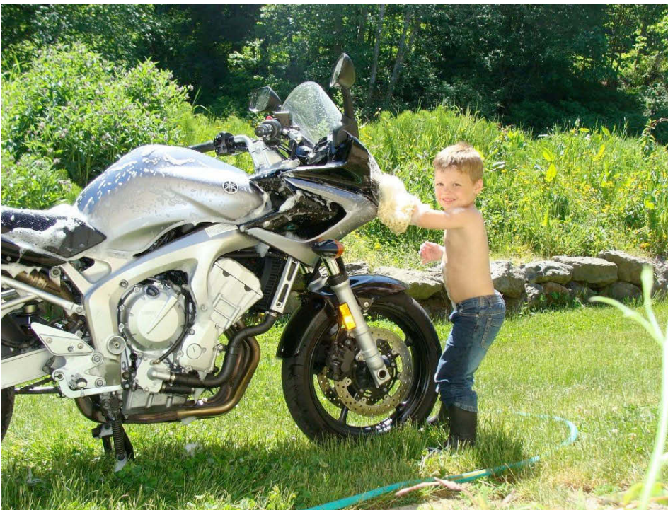
Give your bike a bath before bedding it down for its long winter nap

In order to do this, remove the spark plugs and put a little squirt (about a tablespoon) of engine oil into the holes, then turn your