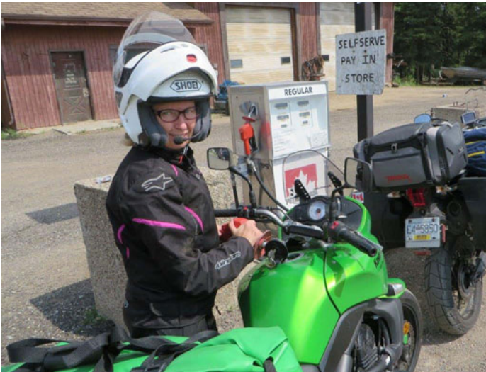
Fueling up in Flin Flon, Manitoba.