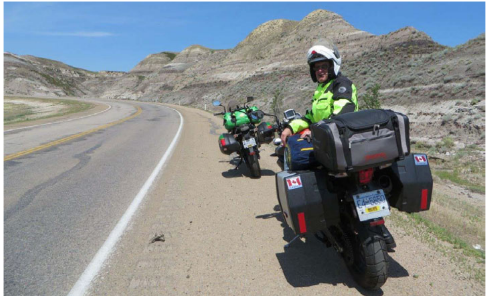
Leaving the Badlands at Drumheller, Alberta.

and Cindy had a waterproof green duffel with our camping gear. We intended to stay indoors on this trip but took the camping gear for emergencies such as small towns with all motel rooms booked up.