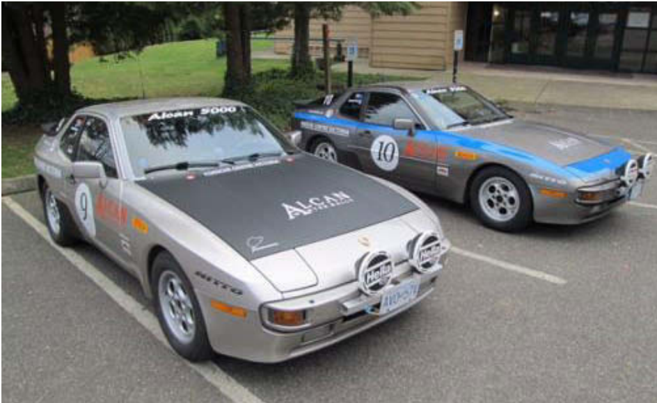
Klaus and Johan mount 2 Porsche 944s for a rally to the frozen north