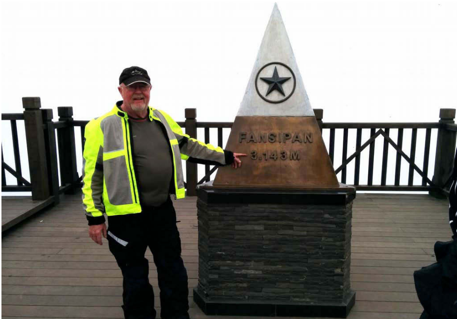
After the 6.9 Km cable car ride, 100 gasping steps and a funicular ride the summit of Mt Fansipan with the view obscured by cloud.

Along with the good road there was spectacular scenery. Hard to keep your mind on the road. We kept climbing and my bike kept gasping for air but nothing that couldn't be overcome by a downshift.