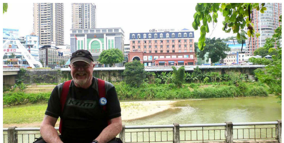
Relaxing at a shaded park in Lau Cai after lunch, in the background, across the Pink river is the city of Hekoushen China.

The departure from Sapa was under threatening skies and it wasn't