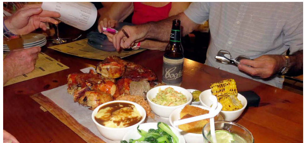
Our last meal as a group at the Moose and Roo on the old grounds of the US embassy. The BBQ was delicious and tender as opposed to most of the meat dishes served with the local fare.

some very mountainous roads with exceptional scenery, stopping in a small village for a break which gave us time to check out the