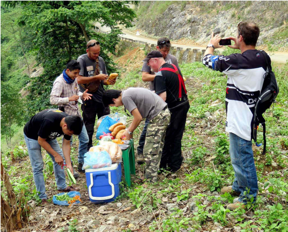
Lunch was taken at the side of the road. All hands assisted in the preparation usually after the photos had been taken.

until we were in our underground parking garage that I realized our lead had his wet gear on. I quickly donned mine, but was still the last one out of the garage with Chan on my tail. I missed the second corner marker and went straight instead of left and was chased down by Chan, who led me back to where we met the van and he indicated for me to carry on with him in sweep. After about 10 km Chan caught up to tell me that we were going in the wrong direction. We turned around and finally caught up to the group who were patiently waiting, except for our guide, for us to catch up.