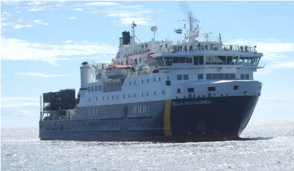
The Bella Desgagnes pulls into Natashquan to start our 44-hour ferry ride to Blanc Sablon.

cry from the $50-60US we are used to paying at Motel 6 in the Excited States.