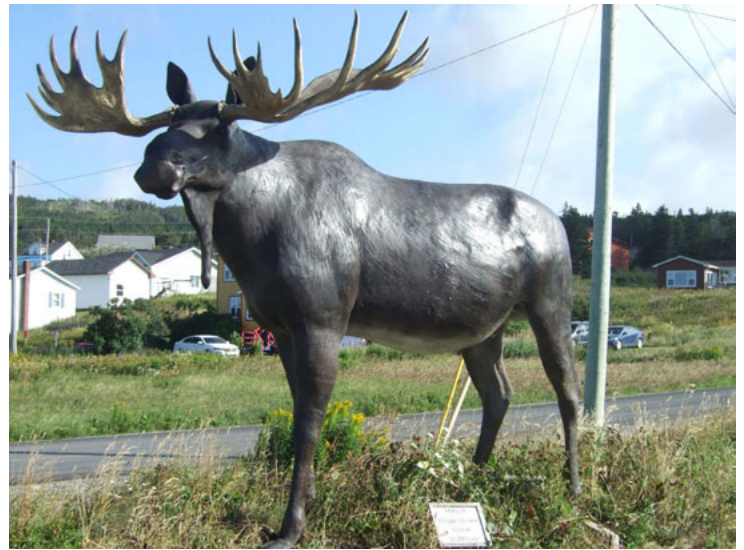
Fortunately, the only moose we saw on the ride was this fiberglass fellow in Rocky Harbour, NL.

Total distance in the truck was 10,020km (it never missed a beat). We rode 4,896km on the bikes – I reckon this equates to around 30,000km on a more comfortable seat.