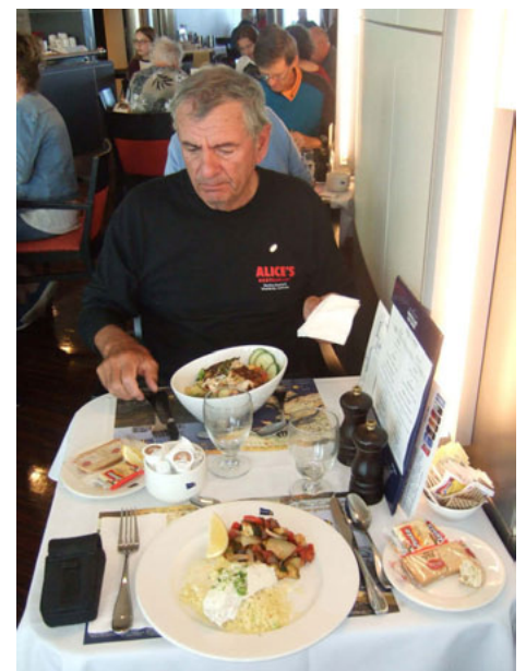
We dined in style aboard the Bella. Three choices of main courses, too.