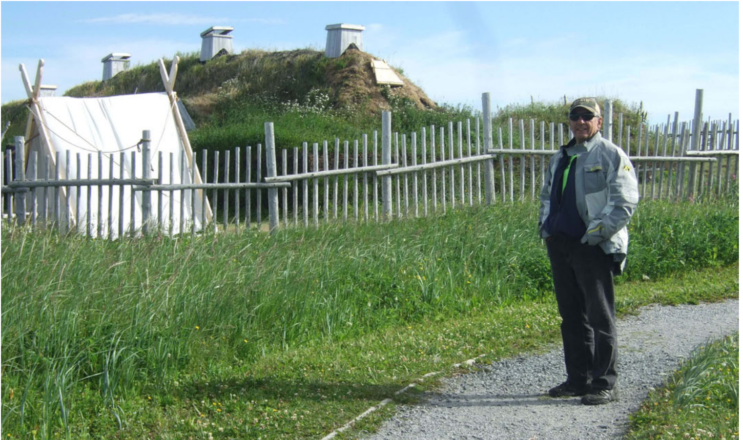
A latter-day Viking checks out L'Anse aux Meadows, where the Vikings landed a thousand years ago.

At Forestville, we crossed the St. Lawrence again and rode west from Rimouski on the South Shore.