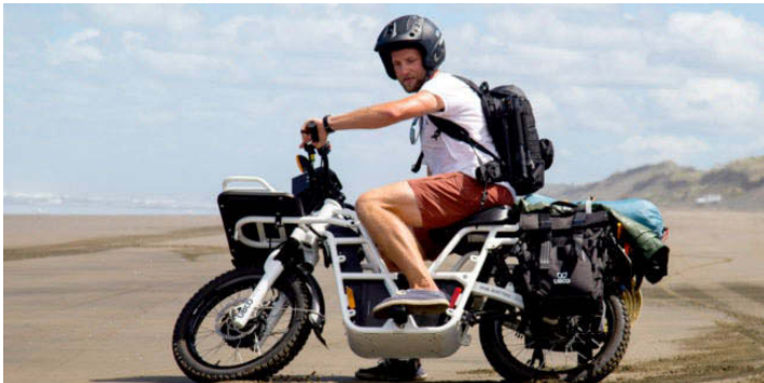
Work or play on the UBCO 2x2