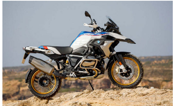
2019 BMW R 1250 GS

In Asia, huge markets like Indonesia are showing even