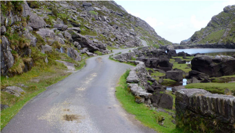
A straighter section of the road through the "Gap of Dunloe" on the Ring of Kerry. Note the biological hazards which were ever present on most of the country roads.

from countries who ride on the right side of the road and on departure Paul leads you until it is time to stop for lunch then after dining sends you on your way with one more warning to never take your eyes off the road for one second and to keep your left shoulder to the left side of the road.