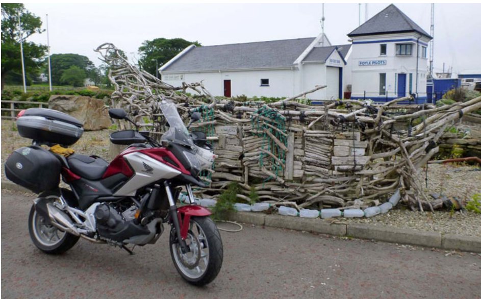
Waiting for our last ferry ride which would take us across Lough Foyle and into Northern Ireland. Greeting us on that side was HMP Magilligan. One of the grimmer places I have ever ridden past and it seemed to set the tone for me during our short stay in Northern Ireland.