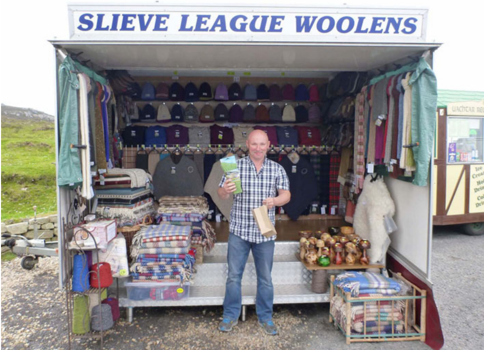
At the Slieve League cliffs view point this fellow sold me a pair of Irish wollen socks and talked my ear off. There was also an espresso cart and a hot dog vendor for those tired and thirsty from the up to the lookout. One of the fine advantages of touring on a motorcycle is the ability to ride where the cars can't or are not allowed go.