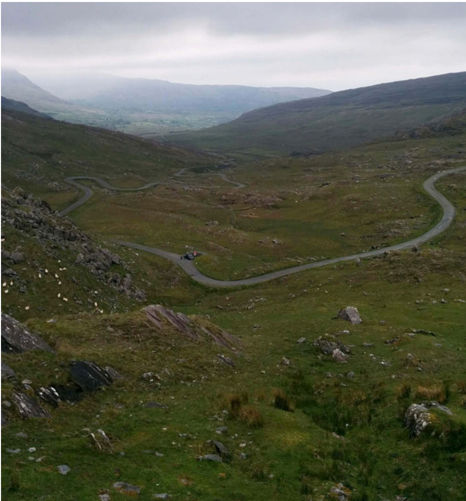
The Healy Mountain Pass on the Beara peninsula taken from the top of the pass. Although this road was constructed in the 1850s I am sure it wasn't the oldest road we travelled.

in Dublin shaking off the jet lag, visiting the city and getting caught up in the "Referendum" fever. Friday morning we were picked up promptly at 0800 by Paul's son David and whisked to Celtic Riders garage located in the peaceful countryside 30 km south west of the city.